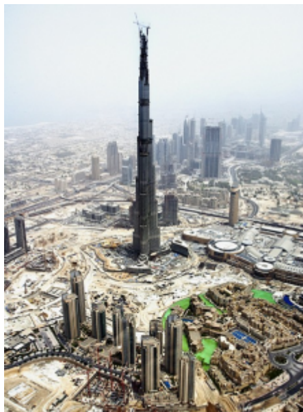
Fig.1 : Tallest building in the world (termitary - left, Burj Khalifa - right)